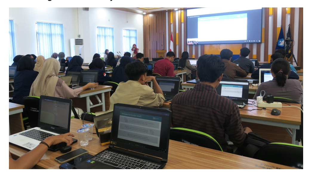
Course 'Introduction to Cloud 101' for students from the University of Bengkulu

On September 12, 2023, TALENTA organized an event at Bengkulu University. The event featured the "Introduction to Cloud 101" course and included the signing of a Memorandum of Understanding (MOU). This hybrid event drew participation from 40 in person students, and an impressive 1,020 students who joined virtually via online platforms and Bengkulu University's YouTube channel.