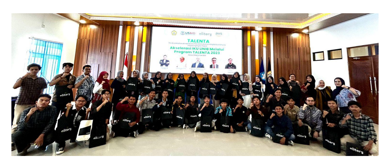
TALENTA participants, students from the University of Bengkulu

On September 12, 2023, TALENTA organized an event at Bengkulu University. The event featured the "Introduction to Cloud 101" course and included the signing of a Memorandum of Understanding (MOU). This hybrid event drew participation from 40 in person students, and an impressive 1,020 students who joined virtually via online platforms and Bengkulu University's YouTube channel.