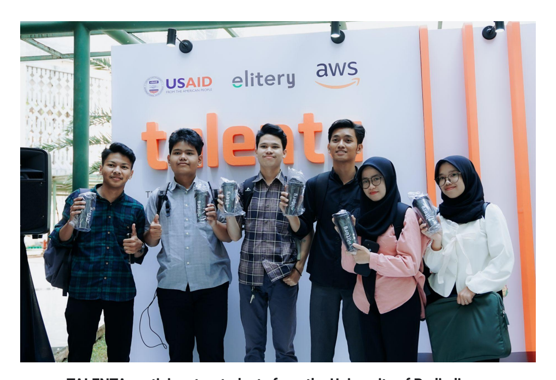
TALENTA participants, students from the University of Padjadjaran

As the first step of the University Program, TALENTA participated in the Joint Tahap Persiapan Bersama (TPB) Opening Ceremony at Padjadjaran University (UNPAD) on Friday, September 12, 2023, in Jatinangor, Sumedang, West Java. During this event, TALENTA collaborated with UNPAD for the Opening TPB program launch. One of the goals of the TPB program is the Digital Literacy Movement, and TALENTA is actively supporting UNPAD in achieving these goals. This initiative is designed to introduce students to cloud computing technology, providing insights into technology utilization and potential career opportunities in the field of cloud computing.